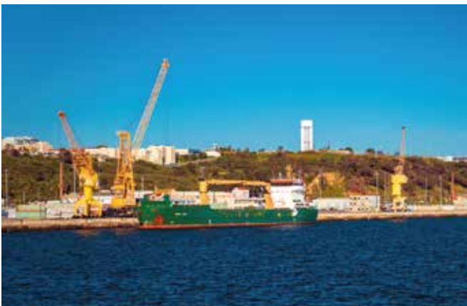
Port of Setubal

Setubal, is located at the Sado River bench, near the largest white sand beach in Europe (65 km) and Troia and Comporta's notable leisure facilities. Enjoy a safe country with a friendly social environment, a Mediterranean climate with 3,000 hours of sunshine a year and excellent health and education infrastructure, including international schools.