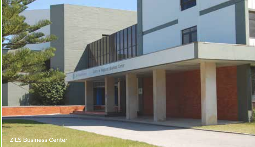
ZILS Business Center

ZILS Business Centre, has all the infrastructure and human resources to boost the success of your business. It enhances the creation of synergies between companies and allows an easy installation with total cost control.