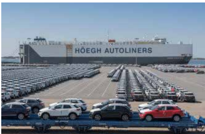
Port of Setubal

Setubal, is located at the Sado River bench, near the largest white sand beach in Europe (65 km) and Troia and Comporta's notable leisure facilities. Enjoy a safe country with a friendly social environment, a Mediterranean climate with 3,000 hours of sunshine a year and excellent health and education infrastructure, including international schools.