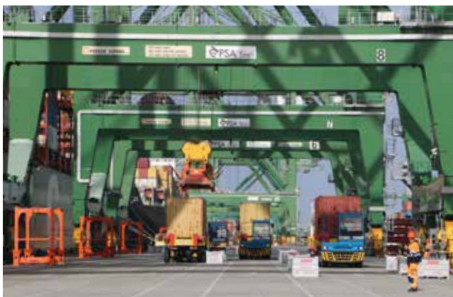
Port of Sines.

Sines is located on the Portuguese southwest coast, next to the largest white sand beach in Europe (65 km). Enjoy a safe country with a social friendly environment, with a Mediterranean climate, with 3.000 hours of sunshine a year and excellent health and education infrastructures.