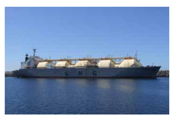
Port of Sines.

Proximity to 3 airports: Lisbon, Beja and Faro.