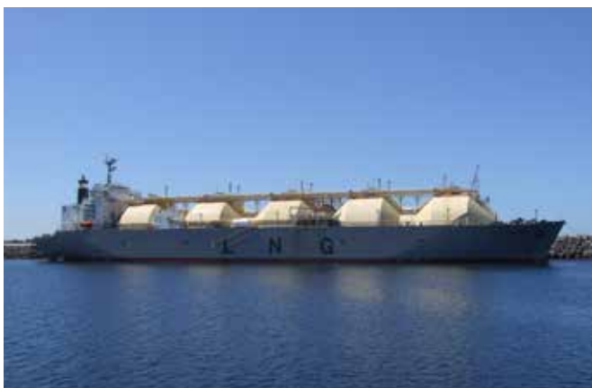
Port of Sines.

Sines is located on the Portuguese southwest coast, next to the largest white sand beach in Europe (65 km). Enjoy a safe country with a social friendly environment, with a Mediterranean climate, with 3.000 hours of sunshine a year and excellent health and education infrastructures.